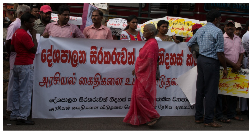
Issues of Tamil political prisoners and justice for the disappeared are completely absent is the mainstream presidential election campaign.

The leftist alternative NPM has pledged to devolve power to the regions. But justice for the victims and survivors of war and do not form part of the political agendas of either of the candidates from NPM and SLPP.