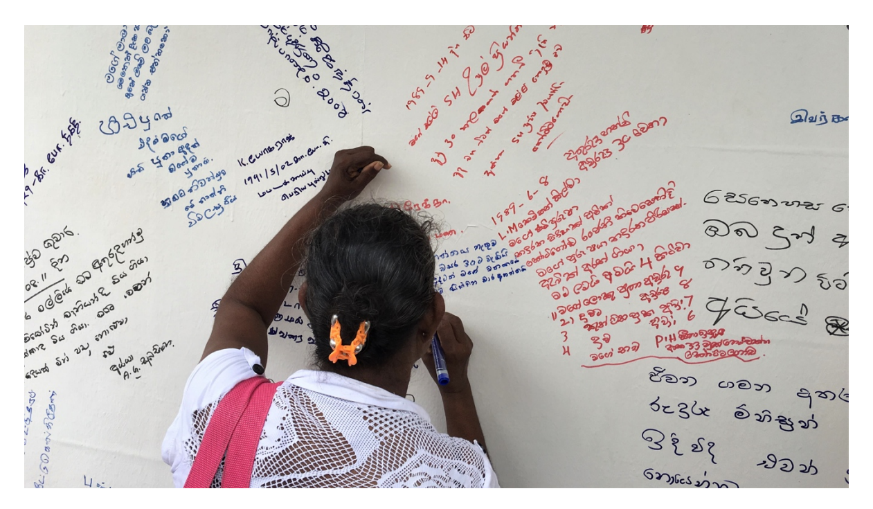
A wife from the South writes a note on her disappeared husband on the temporary memorial wall at OMP office, Colombo on the International Day for the Disappeared.