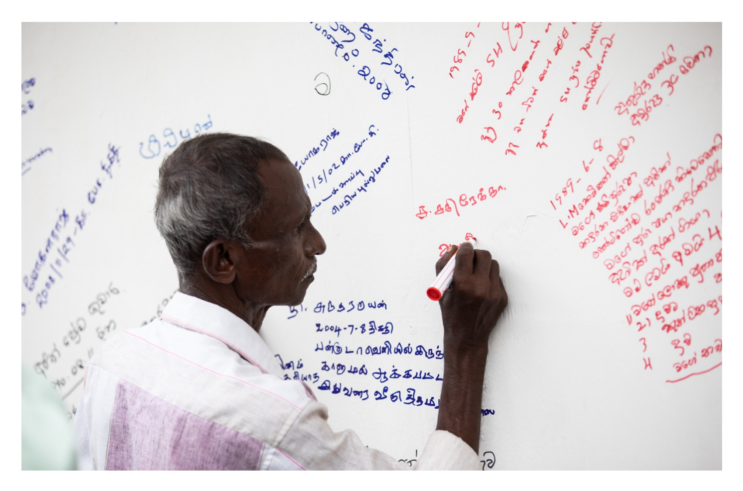
A father from the East writes a note on his disappeared son on the temporary memorial wall at OMP office, Colombo on the International Day for the Disappeared.

Sri Lanka Briefing Notes | Issue No 16 - September 2019