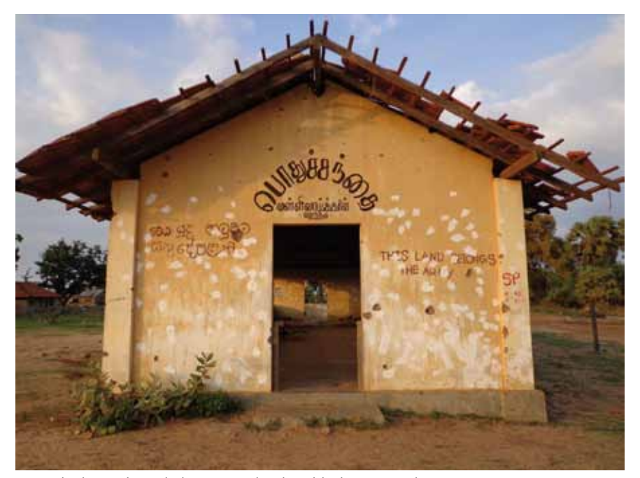
In Sinhala and English it says this land belongs to the Army (Original Tamil name board:Mullewaikal public market)