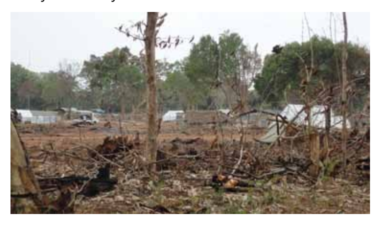
IDPs re-displaced to jungles due to military occupation of their lands, Sep 2012

Puthukkudiyiruppu. Whilst travelling on the Ag and even in interior areas, the military is involved in a majority of the reconstruction work. One school the Watchdog team visited was being rebuilt by the military, with an Army Commander's wife having donated the funds required for it to be rebuilt. While this seems a positive initiative at face value, both these reconstruction efforts and the Army Shops, apart from further legitimizing the presence of the military in the Vanni, also have a negative economic impact on local vendors and builders in the area, as jobs that would ideally have gone to them, are now being carried out by the military.