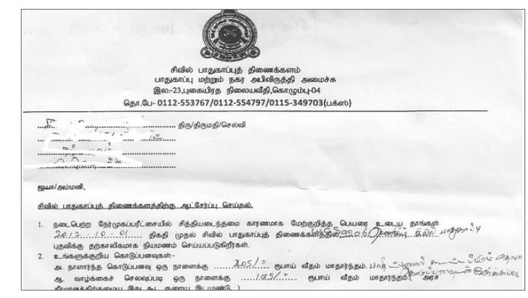
Appointment letter given to pre-school teachers as Civil Security Department temporary personal

Likewise, in the districts of Mullaitivu and Kilinochchi, the Civil Security Department (CSD), run by the SLA, has recruited pre-school teachers, with the promise of paying them SLR 18,500 (approx. USD 146) a month. They are provided with a uniform consisting of a blue saree, which must be worn to daily to work. This is not a practice or regulation for teachers – whether in private or Government-run pre-schools. The Letters of Appointment have been given in both Sinhala and Tamil and have clearly indicated that these teachers would now be considered as part of the SLA. The letter also states that all recruits must