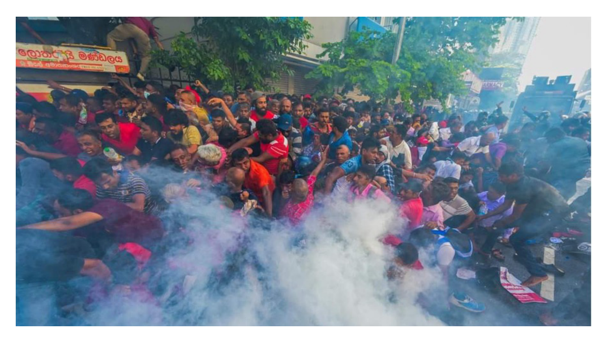
Police crackdown of NPP protest on 26th February was brutal.

Maradana Police obtained a court order from Maligakanda Magistrate Court to banning NPP led protest entering the Hospital Square area in Colombo 07. Earlier same day Fort Magistrate also issued an order preventing the protesters from entering the Ministry of Finance, President's House, Presidential Secretariat between 1pm to 8 pm.<sup>52</sup>