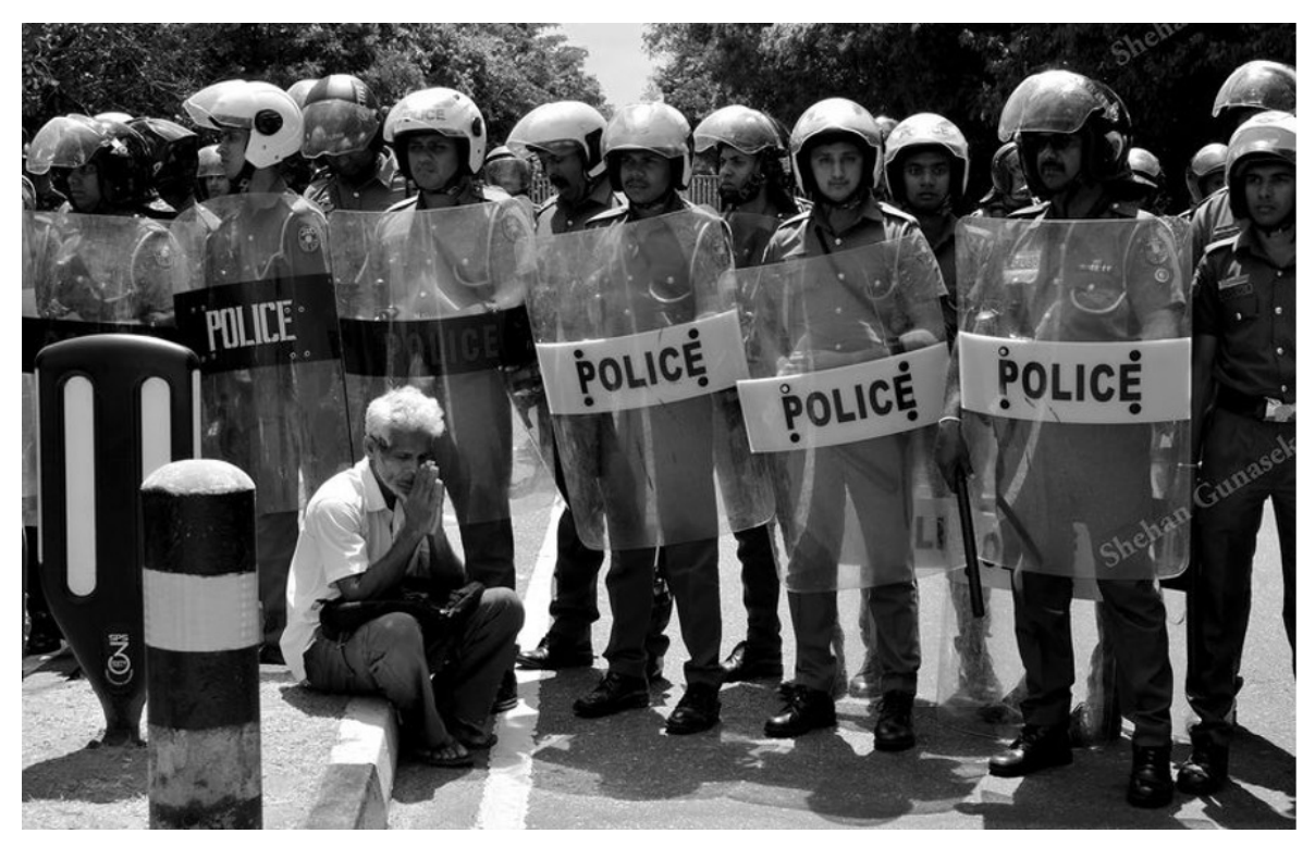
No Comment: 09 February 2023, Colombo, Sri Lanka.