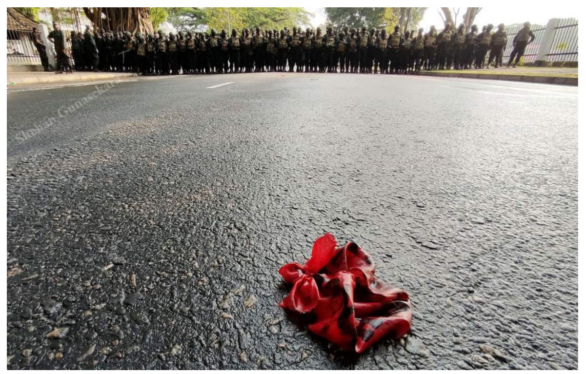
Right to dissent is trampled under military boots in Sri Lanka, 07 March 2023.

The right to dissent is essential for a healthy democracy, and it is one of the most important rights that people have.