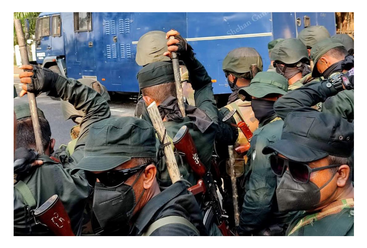
Military carrying polls to attack students

Lawyers representing the Opposition political party National People's Power (NPP) alleging that Police have used expired tear gas canisters and contaminated water against protesters, causing three deaths, and other health complications submitted a Right to Information (RTI) request to the Inspector General of Police (IGP) to obtain a full report on tear gas and water used to disperse protesters.<sup>69</sup>