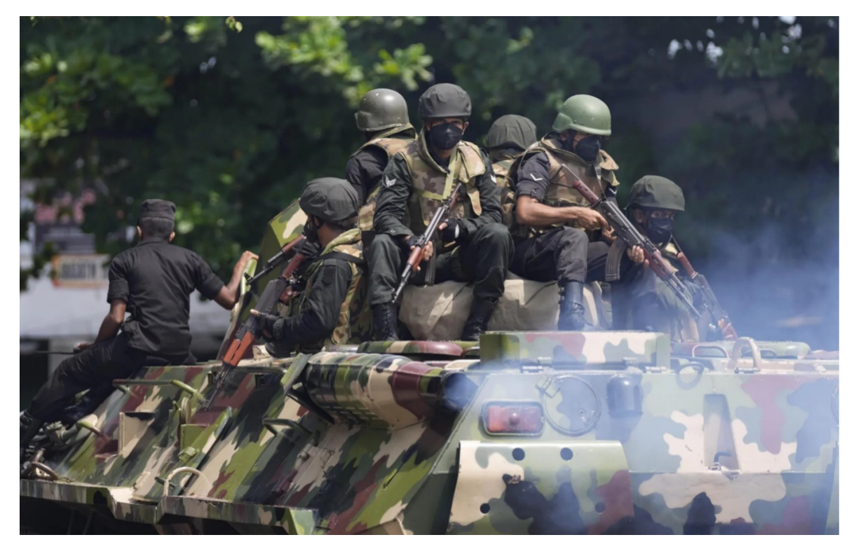
From day one Ranil Wickremesinghe has been relying on military power to rule the nation

TISL also notes that Section 119 of the Bill, which refers to false allegations, appears to send a negative signal to citizens willing to come forward as informants and whistle blowers to report corruption. While the similar provision in the current law has not been misused targeting corruption fighters, this particular provision could become seriously counterproductive and dangerous in a context of a politically influenced public service, or in an adverse environment of stifled civic space, democratic deficits, weak governance or kleptocracy. As an organization that advocates for citizens' freedom of expression, TISL believes that the proposed Bill should be more robust and progressive enough to encourage whistle-blowers and citizens to come forward and report corruption without fear of repercussions, while discouraging the corrupt.