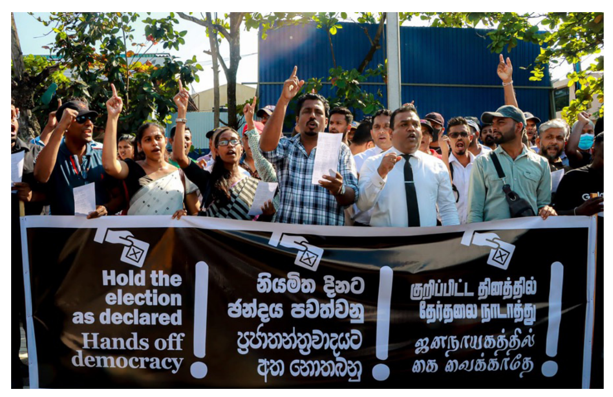
Without regular, free and fair election no democracy can survive

During the period covered by this report, a President issued gazette notifications calling out the Armed forces for the maintenance of public order under the powers granted in the public Security Ordinance (Chapter 40). The gazette notification provides the powers for the armed forces to intervene in civilian affairs. The Sri Lanka government has been issuing similar monthly gazettes for several years now, indicating the continuing trend of militarization and shrinking civil space.