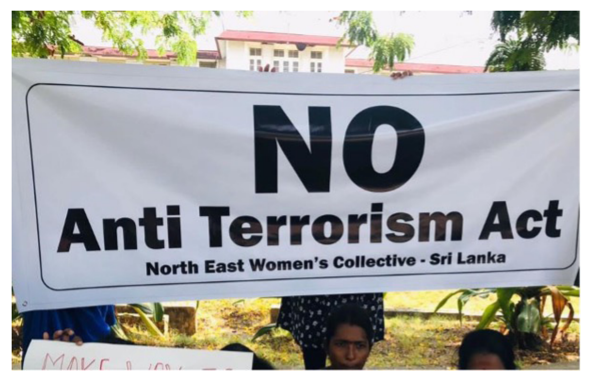
Protest against proposed Anti-Terrorism Act was widesspered

Prevention of Terrorism Act (PTA)2023 to United Nations Hight Commissioner for Human Rights, Sri Lankan civil and political society stated that "the ATA, which is intended to replace the draconian Prevention of Terrorism Act (PTA), is an even more serious threat to democracy in Sri Lanka. We are demanding that the Government withdraw this atrocious proposed law with immediate effect and repeal the Prevention of Terrorism Act.<sup>5</sup>" The appeal urges him to use his good officers to stop enacting the bill in current format.