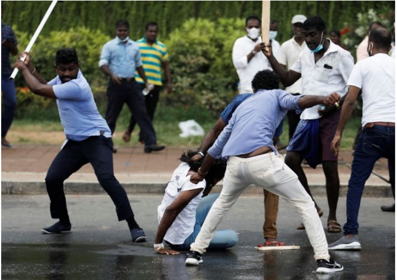
PM Rajapaksa's thugs attacked lone peaceful protestor Vishwa mercilessly while police watching.