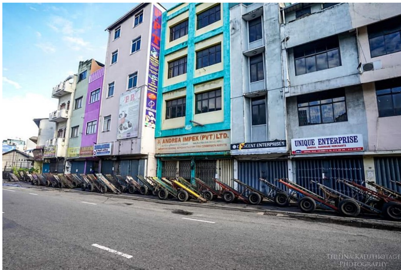
Hartal was a total success as never seen before.

offices shut down demanding the government's resignation. The main demand and slogan were #GoHomeGota.