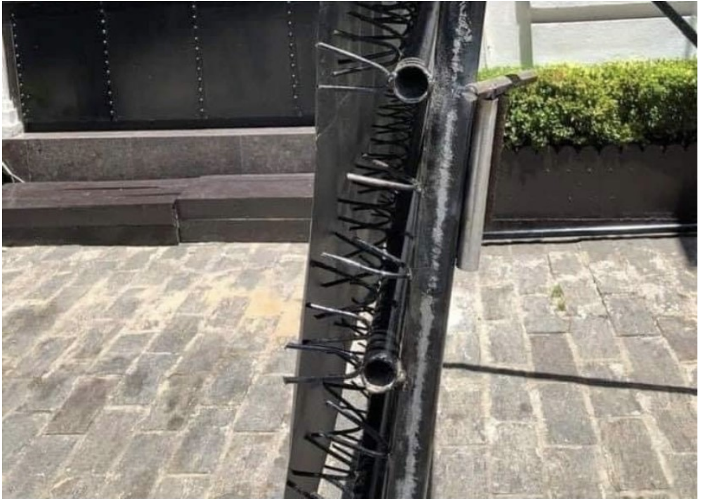
One of the dangerous roadblocks