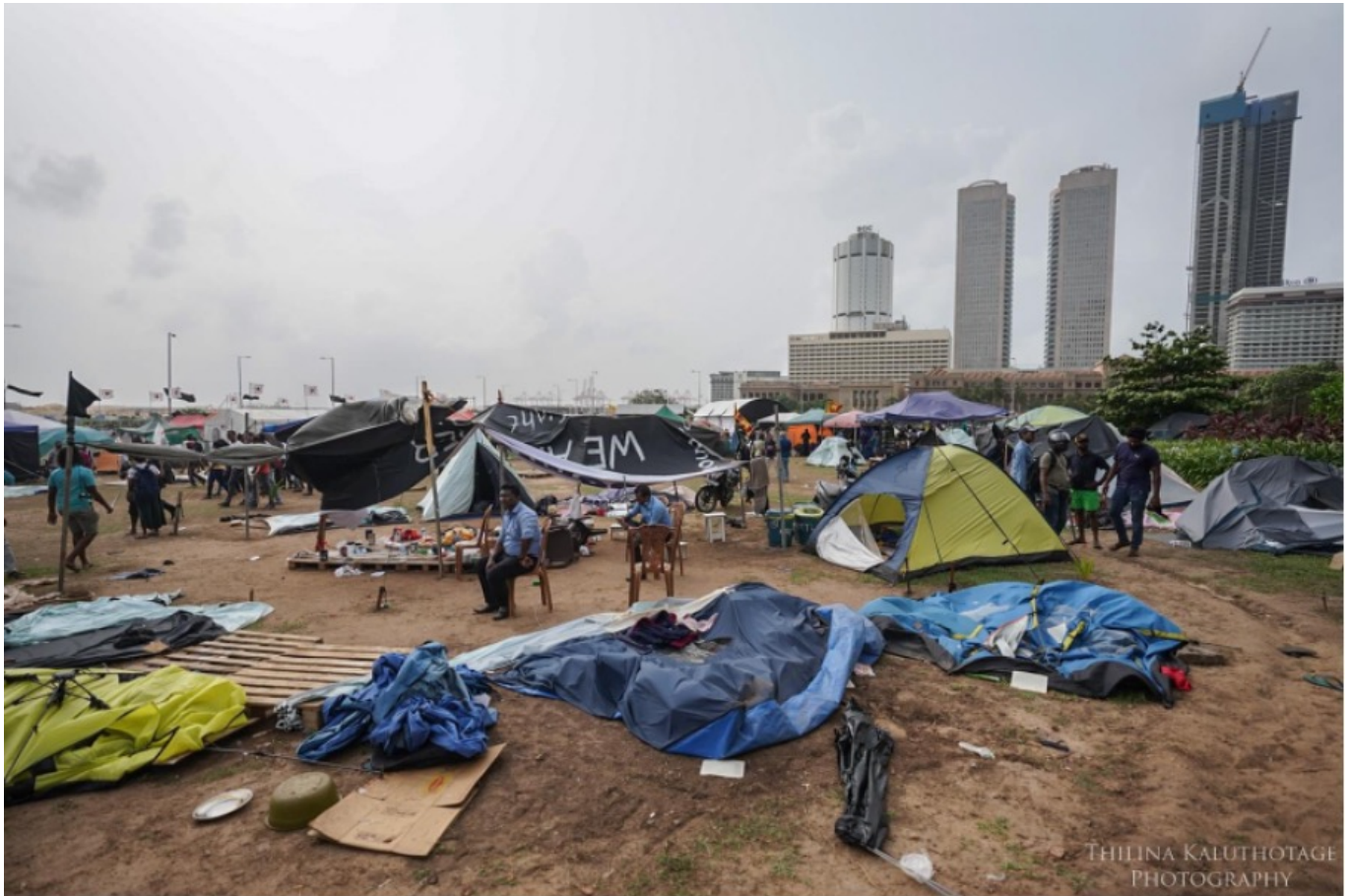
Thugs let loose from PM Rajapaksa's residence destroyed the protest site.