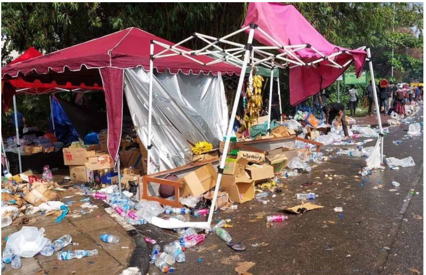
Food tent of the protestors were directly aimed at and destroyed by the water cannons of the police.

Thousands of students belonging to the IUSF launched a “HoruGoGama” (“ThiefsGoVillage”) protest, blocking off the roads leading to the Parliament. On 5th May 2022 morning protesters tried to remove the police barricades. By this time, hundreds of citizens joined the protest. Police used excessive force of water cannons and teargas to disperse the protestors. The teargas canisters were aimed directly at the protestors making some of them injured. Video evidence shows that the police was assaulting some protestors severely. The police used water cannons to destroy the food tent set up by the protestors with the donations of the people.