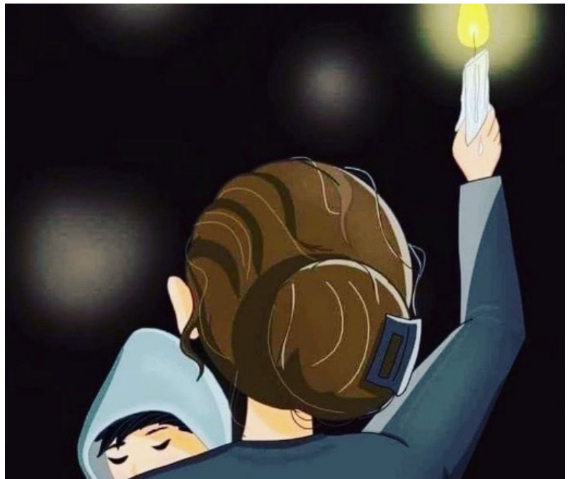
A young mother with her toddler, who joined the protest at Mirihana, became a symbol of resistance.

The police and military used tear gas, water cannons and live bullets against the protestors. Dozens were injured, 53 persons were arrested, including 8 journalists. Some detainees were assaulted by the police. All were given a bail later. So far, no cases are filed.