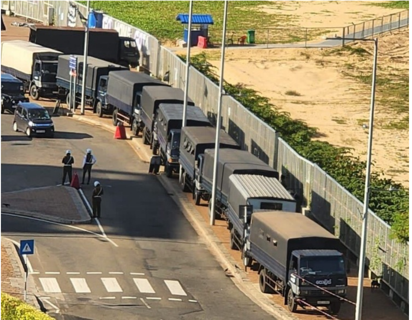
Police trucks came to the protest site.

disrupt in whatever manner a peaceful protest by the people of this country. Any such attempt will have grave repercussions for the country, its democracy, its economy, and the rule of law”. 5