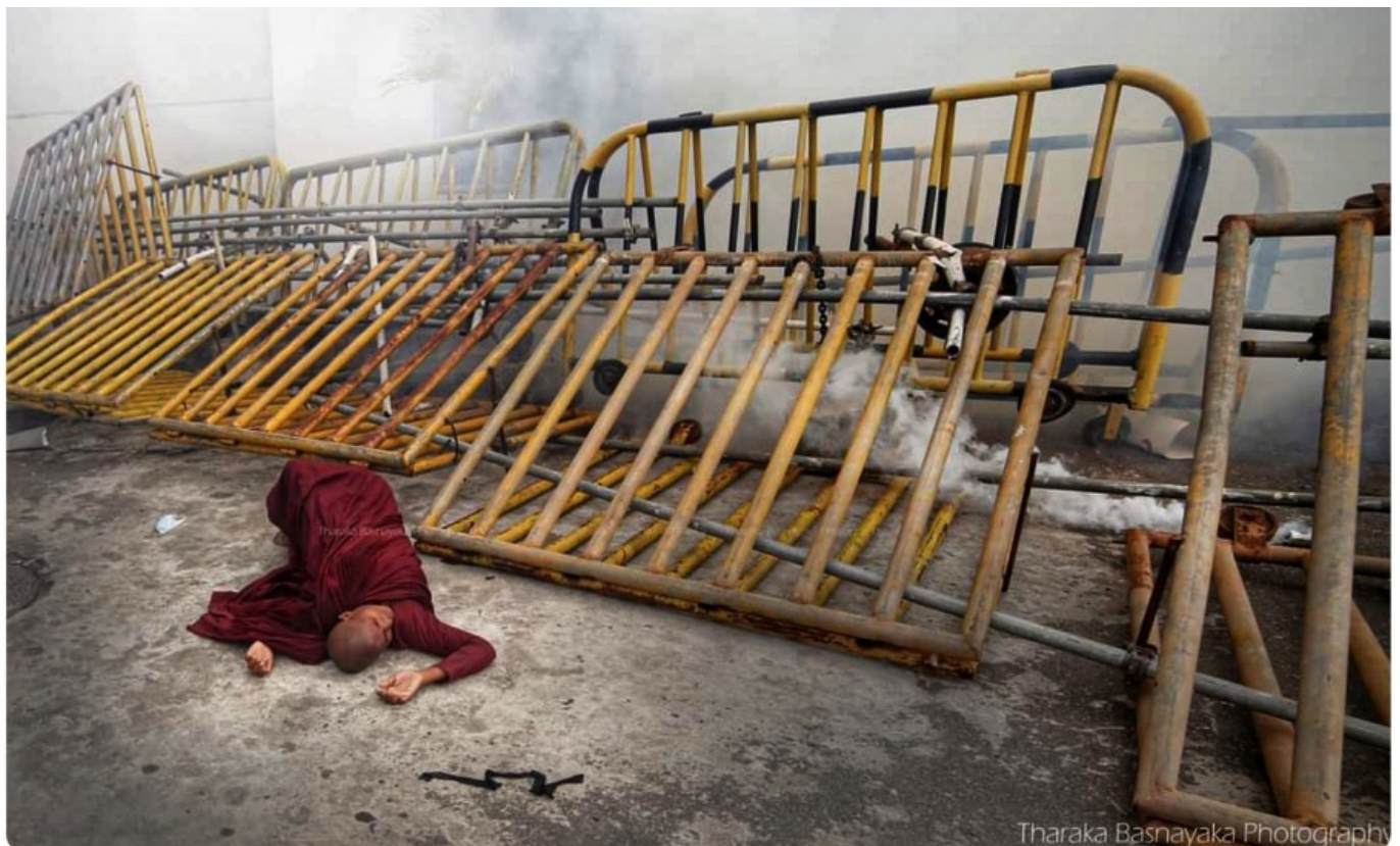
On 9th June 2022, near the Policy Headquarters, a buddhist nun lay unconcious after facing huge dose of teargas.