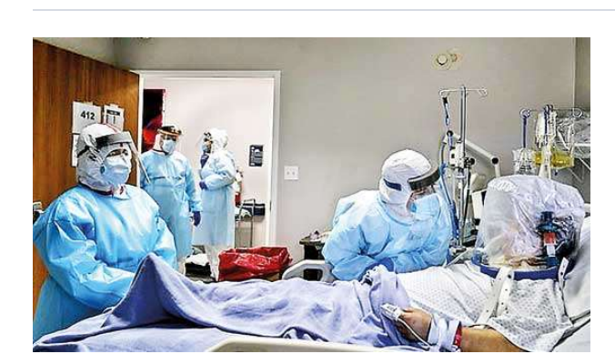
More than 1,000 Americans die from coronavirus for fifth day