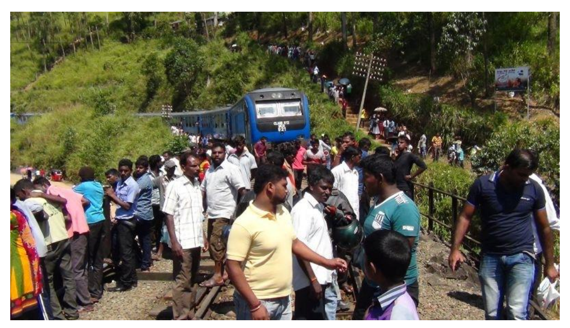
Protesting people blocked the upcountry railway line for few hours