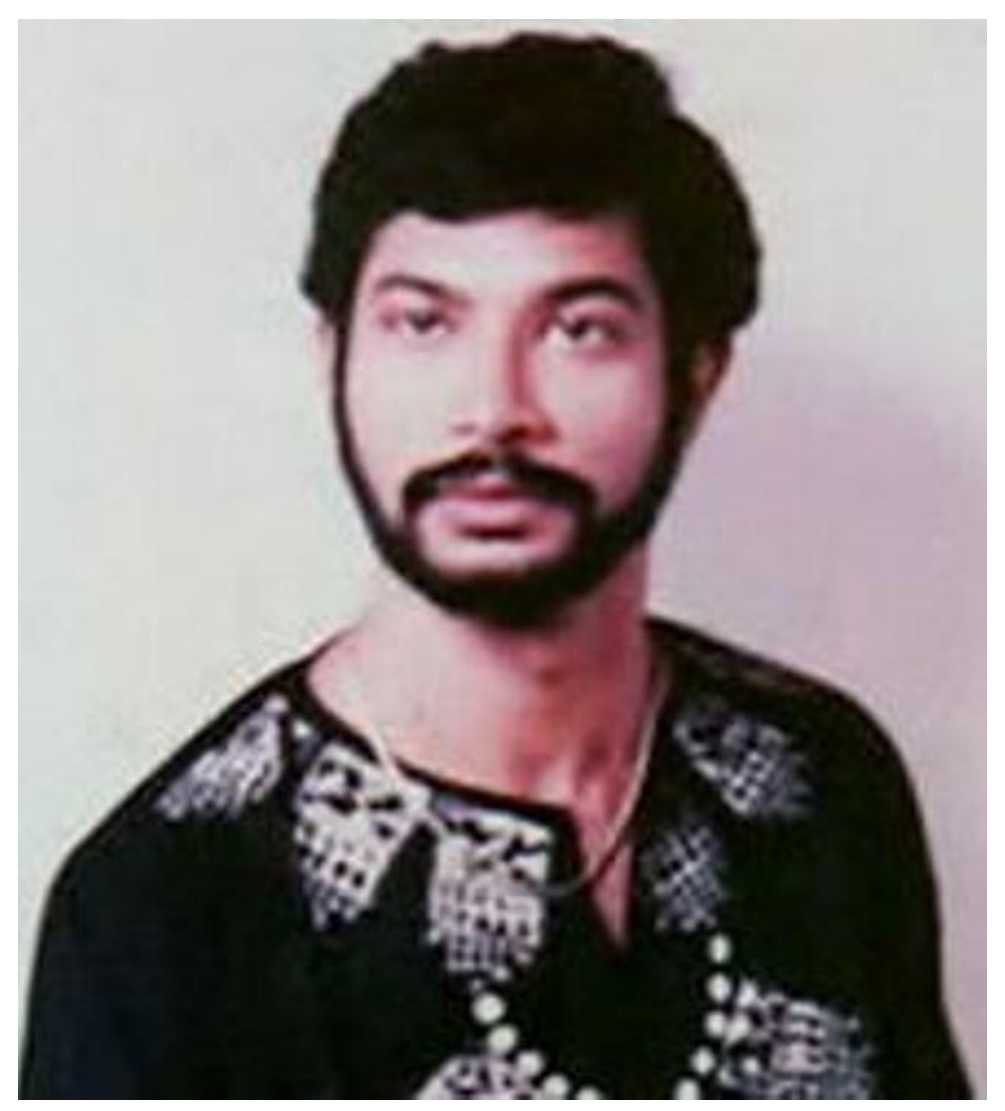
The Government has not given green light to the production of a film on well-known journalist Richard de Zoysa who was abducted by the police and killed on 18 February 1990

In the first 100 days of new Presidency 9<sup>th</sup> January – 19<sup>th</sup> April 2015