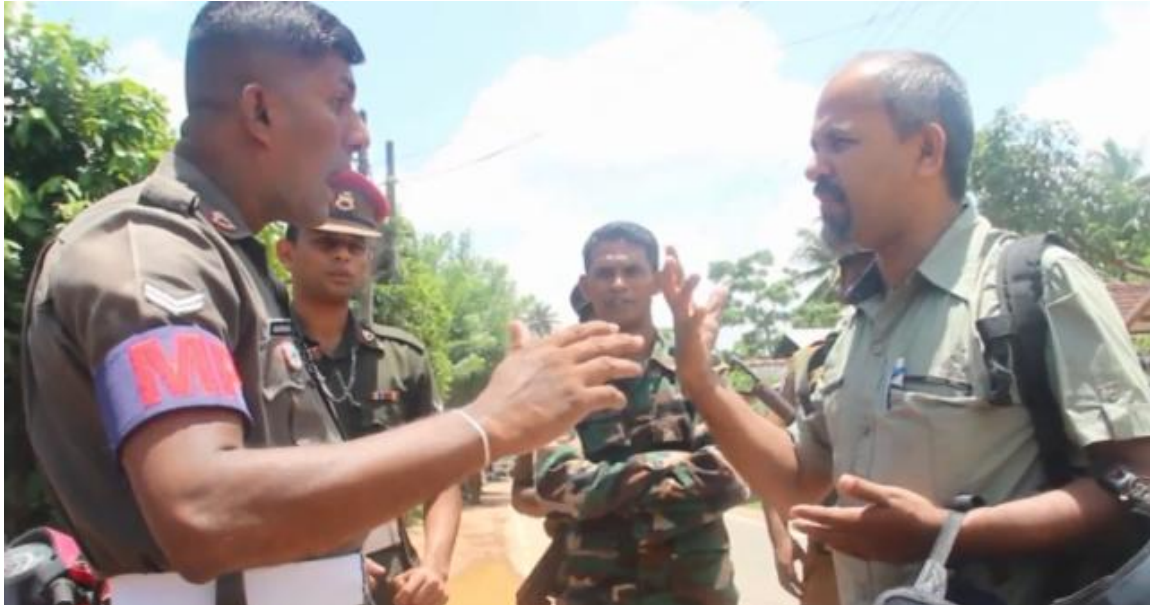
“This is a military area ruled by the military; No entry for journalists without prior permission” officer tells the journalist