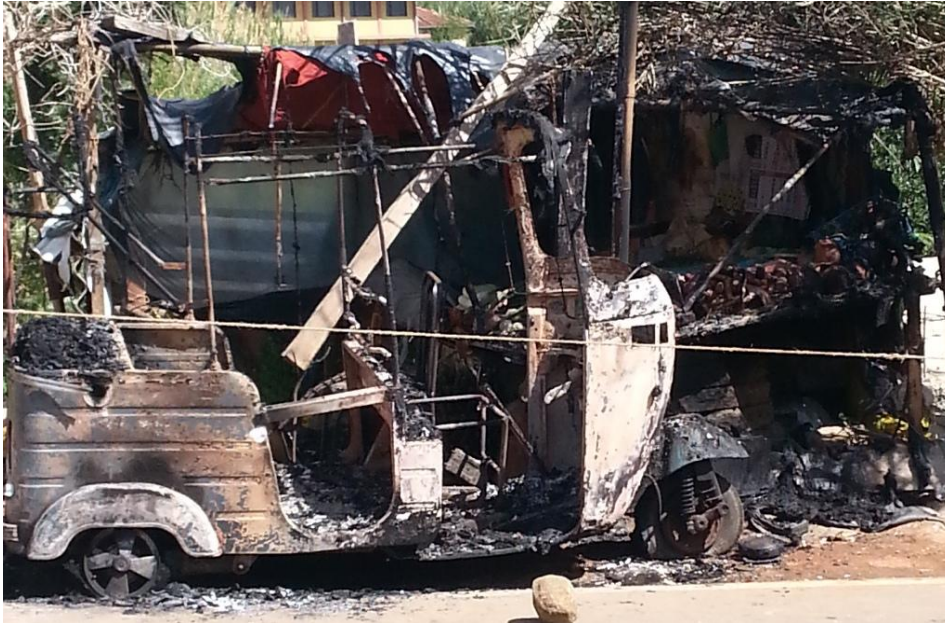
Around 50 election offices of the opposition parties were attacked during the Uva Provincial Council election [A burned three wheeler Taxi belongs to a UNP election office ; Photo:CaFFE]