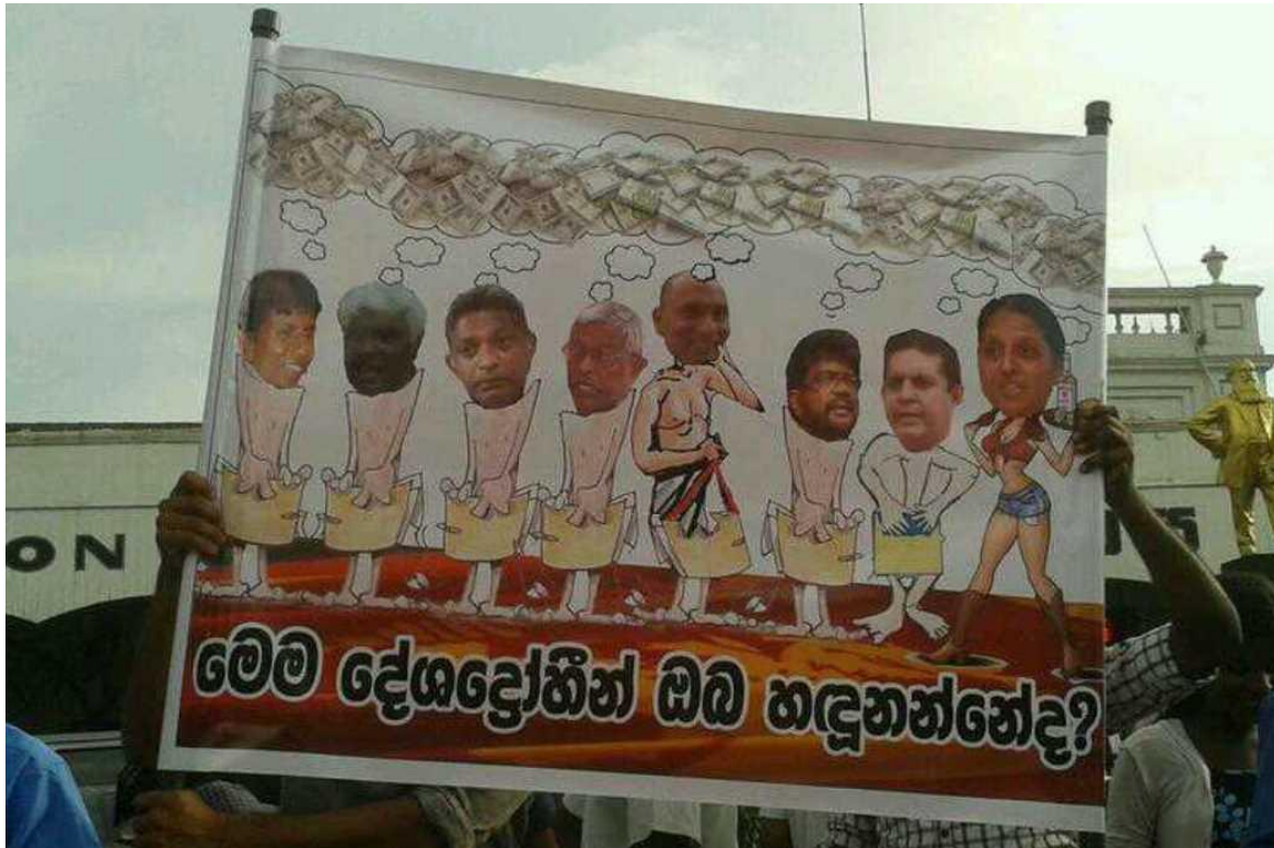
The banner: Do you recognise these traitors?