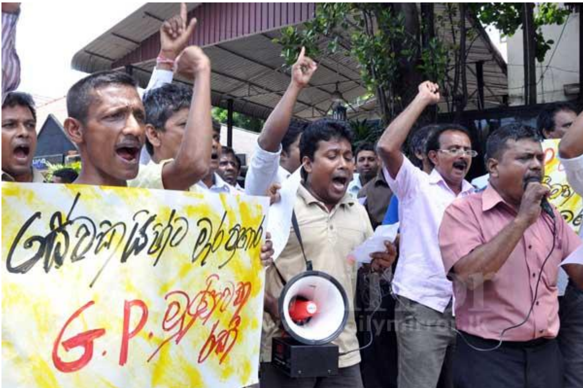
Trade Union of the Government Printing press protests against the assault