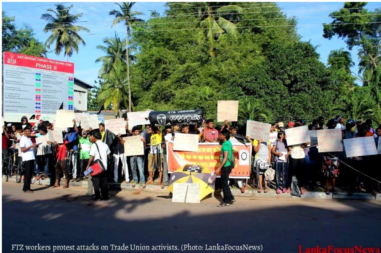
FTZ workers protest attacks on Trade Union activists.