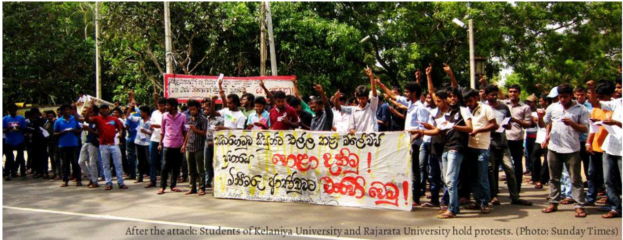
After the attack: Students of Kelaniya University and Rajarata University hold protests.

On the night of the 10 th of October, students of the University of Sabaragamuwa participating in a satyagraha campaign at the Pambahinna Junction on the Badulla-Colombo road were attacked by masked mobsters armed with petrol bombs and wooden cudgels. More than 20 students were injured and 13 were admitted to the Pambahinna rural hospital following the attack. Six were later transferred to Balangoda Base hospital. Students had launched the satyagraha in protest of the abolition of university student unions in state-run universities. The satyagraha was also organized in protest of the suspension of students in various incidents and the non-implementation of Human Rights Commission recommendations.