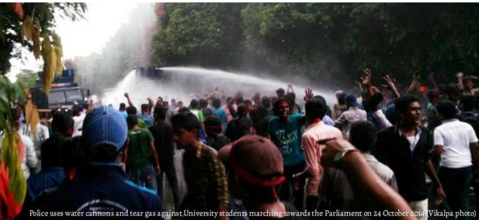
Police uses water cannons and tear gas against University students marching towards the Parliament on 24 October 2014