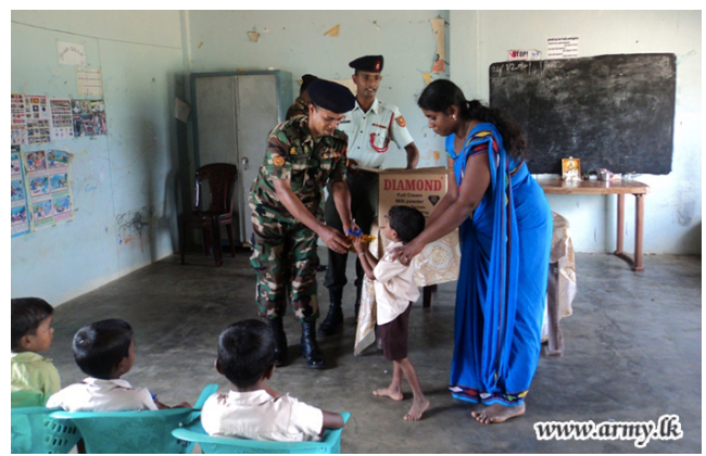
Troops from 573 Brigade distributing gifts to pre-school in Kilinochchi<sup>54</sup>

Following the CSD's hiring of pre-school teachers, many pre-schools in Mullaitivu and Kilinochchi were distributed uniforms with CSD logos for students to wear.<sup>55</sup> In 2016 alone, 907 pre-school children were given uniforms in Kilinochchi.<sup>56</sup> Pre-school teachers were also given uniforms in the form of blue sarees, which other pre-school teachers do not have.<sup>57</sup>