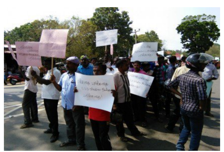
CSD employees protesting against the Northern Provincial Council - April 24, 2017

On April 24, 2017, CSD workers protested in Kilinochchi, against the Northern Provincial Council requests to transfer ownership and control over CSD-run farms and pre-schools to civilian authorities. CSD workers marched to Kilinochchi District Secretariat with placards saying that farms should remain under military control. 110 Yet when ACPR interviewed CSD workers about this protest, individuals either did not understand what the protest was about and simply went because they had been instructed to, or they went because they felt they had to attend if they wanted to keep their jobs. 111 This protest is an obvious example by which the CSD system oppresses and controls the war-affected Tamil population of the Vanni, but there are many more complex and subtle ways in which it does so as well.