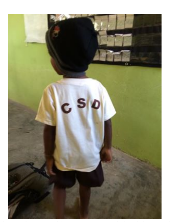
CSD Pre-Schooler donning uniforms provided by military – 1 May 2016 Source: Tamil Guardian<sup>58</sup>

Following the CSD's hiring of pre-school teachers, many pre-schools in Mullaitivu and Kilinochchi were distributed uniforms with CSD logos for students to wear.<sup>55</sup> In 2016 alone, 907 pre-school children were given uniforms in Kilinochchi.<sup>56</sup> Pre-school teachers were also given uniforms in the form of blue sarees, which other pre-school teachers do not have.<sup>57</sup>