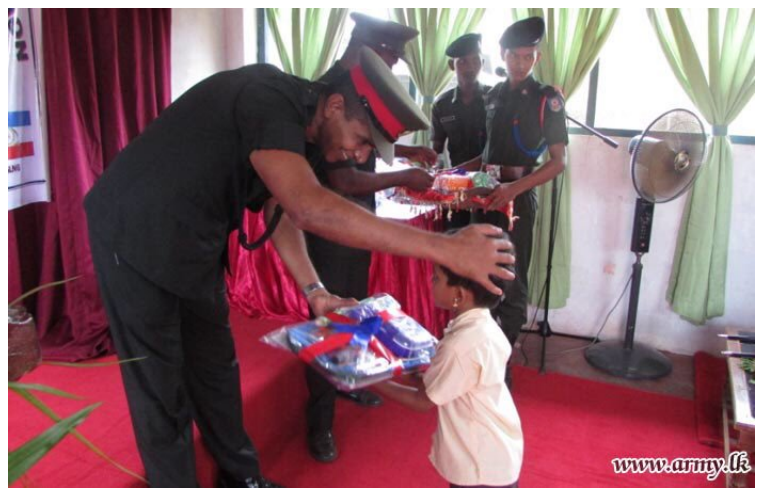
Military issues stationaries to nursery kids in a military run pre school in Aandapuram, Kilinochchi - May 28 2017

Regardless, the military is often present at special events, and students often receive awards and gifts from military commanders who are honorary guests at these events.<sup>60</sup>