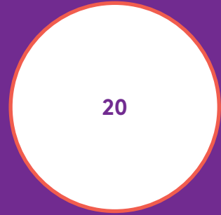
Reprisal against family