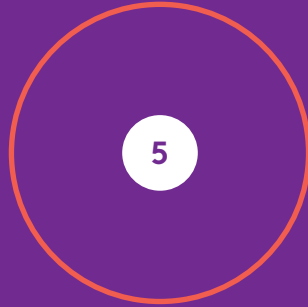
Post-August polls b)