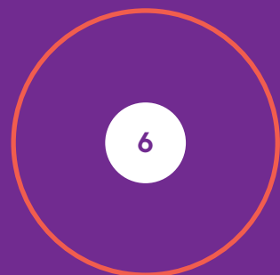
Injured in final war