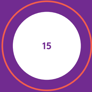
Male to female ratio